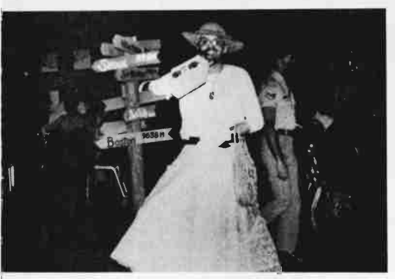
CFUN Radio staged a huge M*A*S*H Bash at Vancouver's Hyatt Regency Ballroom to view the final episode of the series. More than 1000 people dined on ribs and chicken, danced to