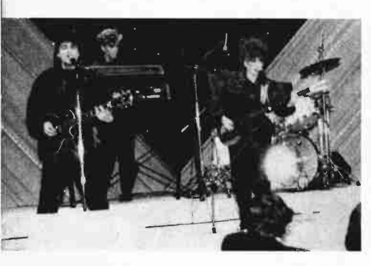
Ready recording group, The Spoons, performing at this year's Junos. Their album, Arias & Symphonies has now gone gold.