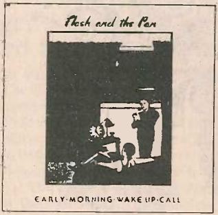
FLASH AND THE PAN Early Morning Wake Up Call Epic - FE-39618-H