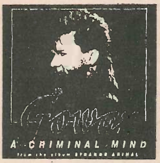
A CRIMINAL MIND Gowan Columbia - C4-7061-H