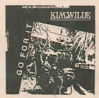
GO FOR IT Kim Wilde MCA - 52513-J