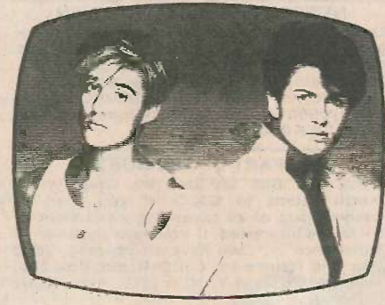
Wham Make It Big