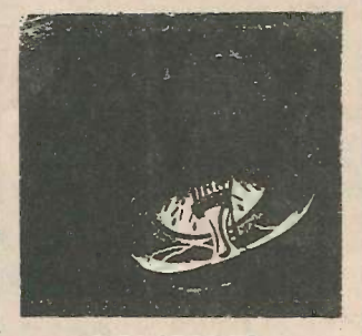
DIRE STRAITS Brothers In Arms Vertigo - VOG-1-3357-Q