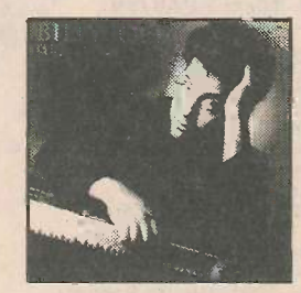
November 20th Ontario B.C. Alberta