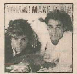
November 20th —Ontario