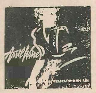
LOVE HAS REMEMBERED ME April Wine Aquarius - AQ-6020-F