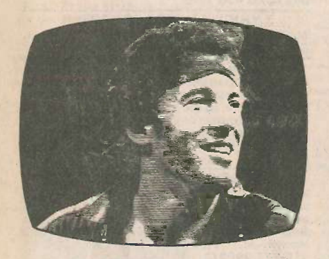
Bruce Springsteen Born In The U.S.A.

FLIGHT #1 WAS A MAJOR SUCCESS -GET READY FOR FLIGHT #2 AS THE PEAK SELLING SEASON RAPIDLY APPROACHES!