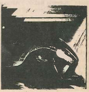
ZZ TOP Afterburner Warner Bros - 92-53424-P