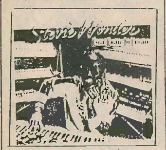
PART TIME LOVER Stevie Wonder Tamla - T-1808-M