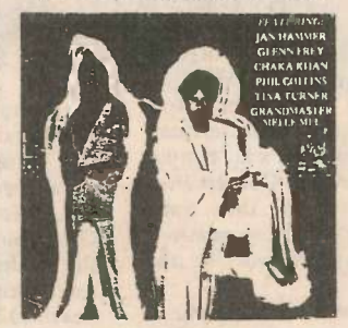
MIAMI VICE TV Soundtrack MCA-6150-J