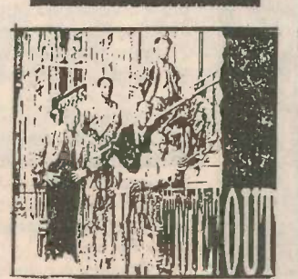
New Edition MCA -52703-J