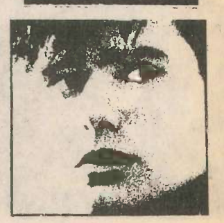
CHARLIE SEXTON Pictures For Pleasure MCA - 5629-J