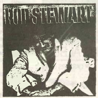
ROD STEWART Pop/Rock Self-titled - Warner Bros - 92-54461-P With the exception of the first single, Love

Music From The Edge Of Heaven Columbia · 0C-40285-H This package offers George Michael's chert-topper Oifferent Corner (June 14/86), I'm Your Man, and their new single The Edge Of Heaven. The majority of the tracks were penned by Michael, with Where Did Your Heart Go the exception, being written by Don and David Was. Certain to achieve excessive sales figures - if hot on the strength of the pre-viously released material - certainal - the previously released material - certainly the new cuts will provide enough impetus for the legions of devoted fans. Unusual packaging includes a peel-off sticker containing LP title and song selection. Should be front-racked