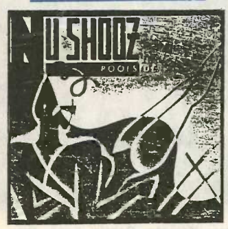
I CAN'T WAIT Nu Shooz Atlantic - 78-94467-P