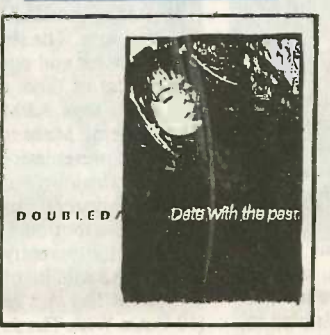
DOUBLEDARE Date With The Past Vertigo/Current SOV-2371-Q