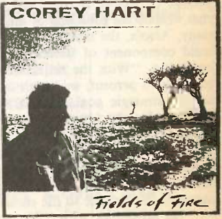
COREY HART Fields Of Fire Aquarius AQ542-F