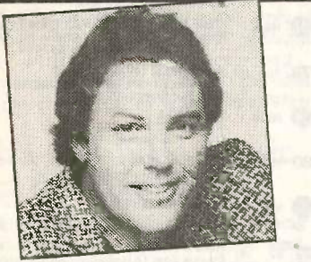
Top Male Vocalist