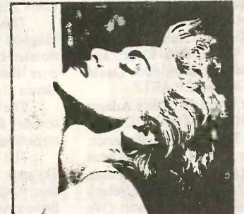
MADONNA True Blue Sire 92 54421-P