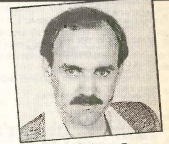
Vista Rising Star of the Year