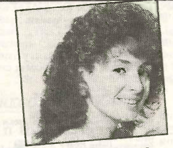
Top Female Vocalist