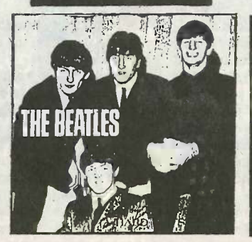
A HARD DAYS NIGHT The Beatles Capitol - B-73015-F