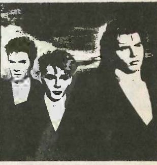
DURAN DURAN Notorious Capitol - PJ-12540-F