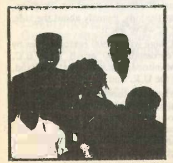
ALWAYS Atlantic Starr Warner Bros - 92-84557-P