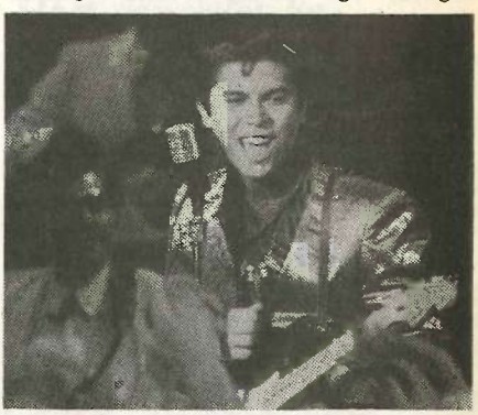
Lou Diamond as Ritchie Valens in the new Columbia picture, La Bamba, which opens July 24.

La Bamba, the Columbia Pictures film on the story of Ritchie Valens' rise to the top of the rock 'n' roll heap of the '50s, opens across Canada on July 24. However, early attention is being drawn to the film through the single