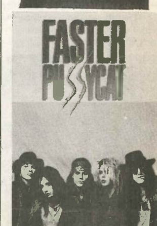
FASTER PUSSYCAT Faster Pussycat Elektra - 96-07304-P