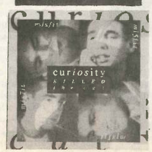
MISFIT Curiosity Killed The Cat Vertigo - SDV-2392-Q