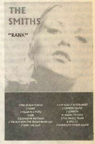
THE SMITHS Rank Sire - 92-57864-P

Tangerine Dream, one of the top bands of the late sixties, displaying a new found confidence with a brand new label, are looking for a comeback.