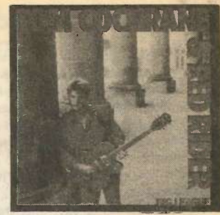
BIG LEAGUE Tom Cochrane/Red Rider Capitol - B-73068-F