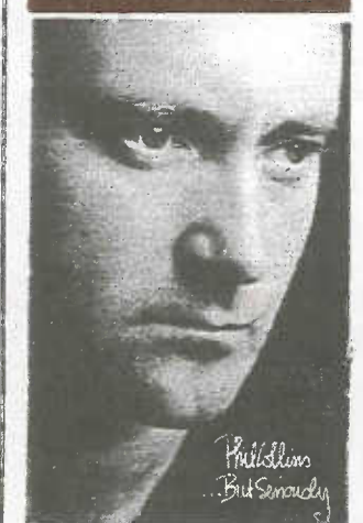
ANOTHER DAY IN PARADISE Phil Collins Atlantic - PROCD-25-P