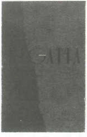
REGATTA Regatta BMG - KKL1-0603-N