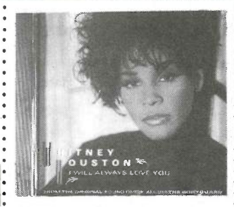
I WILL ALWAYS LOVE YOU Whitney Houston Arista