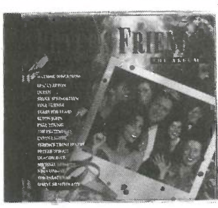
PETER'S FRIENDS Soundtrack Epic Soundtrax - EK 53439-H