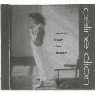
WATER FROM THE MOON Celine Dion Epic