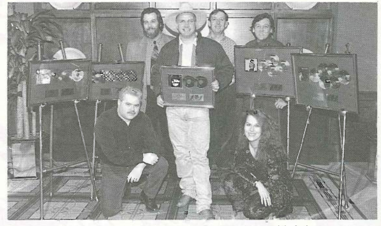
Country music phenomenon Garth Brooks is presented with multi-platinum awards by EMI staffers for four of his previous albums, and double platinum for his two-week-old release The Hits. EMI also reported that Brooks has sold in excess of three million units in Canada.