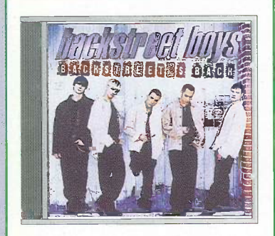
BACKSTREET BOYS Backstreet's Back 41617-2-N