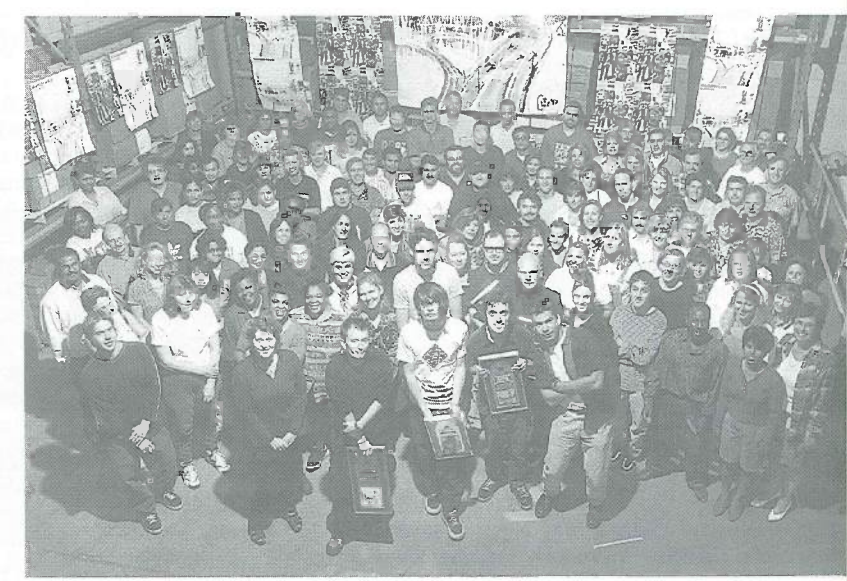
Members of Radiohead stopped by the EMI offices prior to their sold out show at Arrow Hall in Mississauga to pick up platinum awards for their album O.K.Computer.