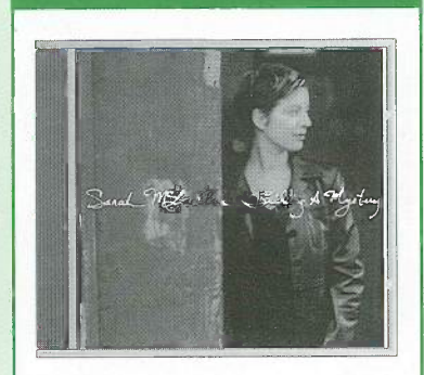
BUILDING A MYSTERY Sarah McLachlan Nettwerk-F