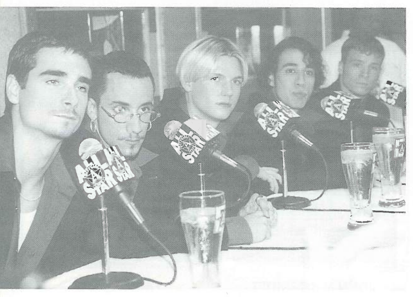
Backstreet Boys in New York for a combined press conference/performance/autograph session to celebrate release of their second album, Backstreet's Back.

Popcan will be Alert's only other release this fall. The CD compilation is described as "a cross-section of some of the best independent contemporary pop bands and their music Canada has to offer." The initial single will be Some Other Guy by Crimson, a Hamilton-based band.