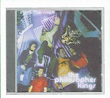
I AM THE MAN The Philosopher kings Columbia-H