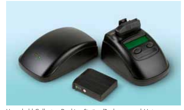
Household Collector, Docking Station/Recharger and Meter

Each panelist is issued his or her own Meter. The Meter collects exposures to encoded stations via a small microphone. The Meter also contains an internal clock, a rechargeable internal battery, a motion detector, and a small green light that remains