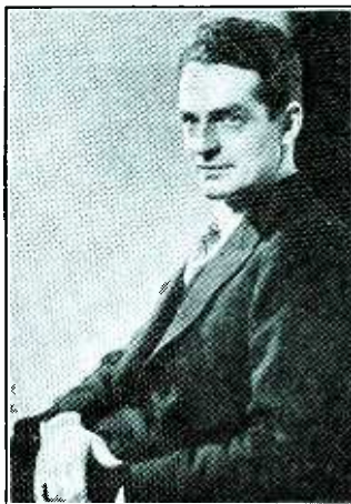
FRED WARING CBS—6:30 P.M.

• KPO & netwk—The Story of Mary Marlin; 9:15, Merry Maes KGO—Electrical Transcription; 9:15, Pair of Pianos