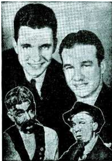
LUM AND ABNER

Their sparkling wit and whimsical philosophy already have made Lum and Abner one of the West's favorite air features. These two lovable old Ozark country hill billy char-