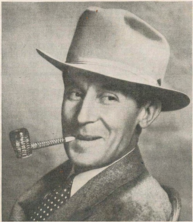
Chic Sale, one of America's foremost humorists. Appearing on the Shell Show over NBC every Monday night at 9 P. M.