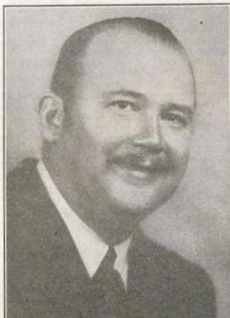
PAUL WHITEMAN NBC—7 P. M.