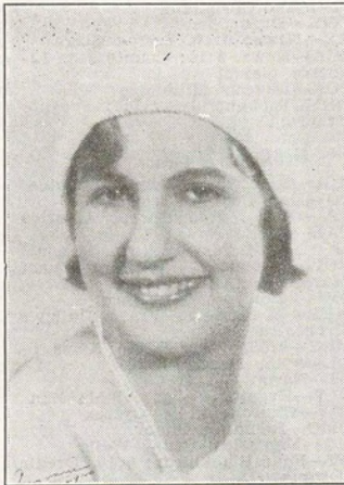
JEAN KENT KTAB—1:30 P. M.