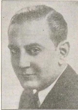
GUY LOMBARDO KPO—7:30 P. M.