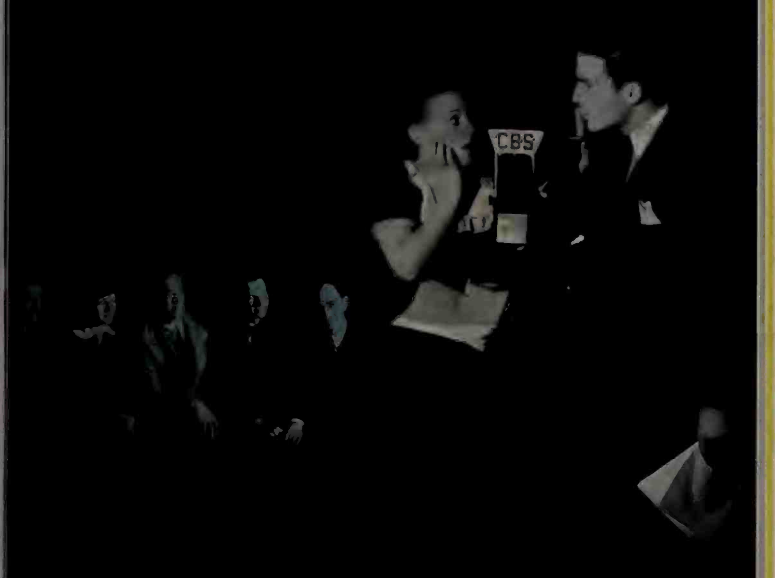
The "Armchair Detectives"