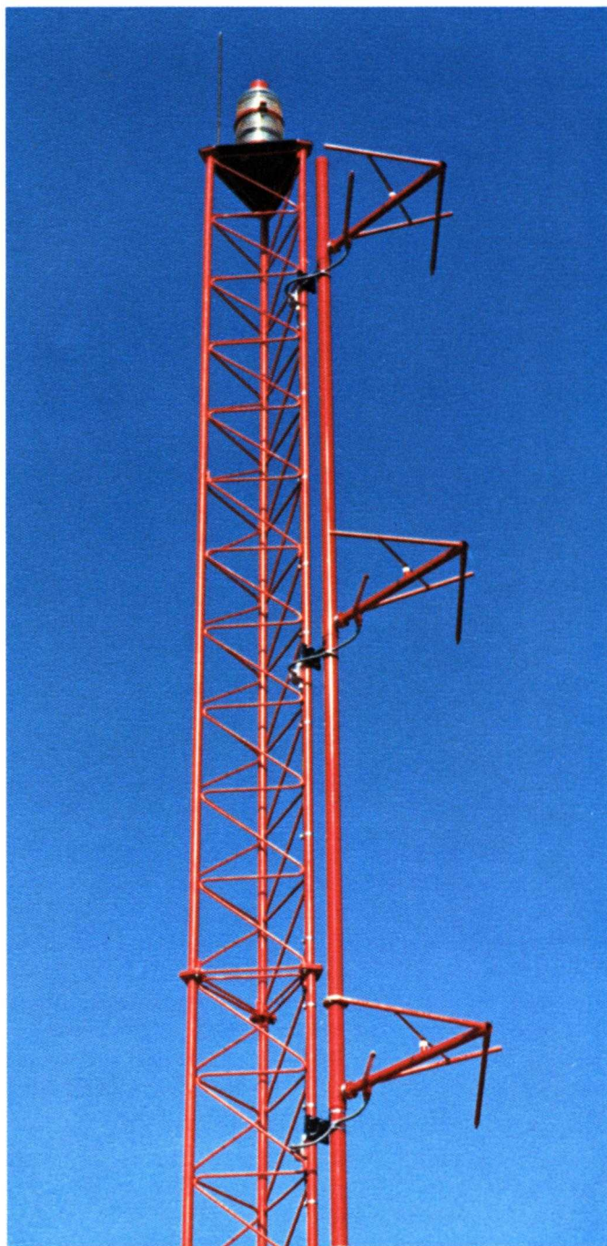
JAMPRO JSCP 3 bay shunt fed antenna using 3/8" rigid line. Note deicer cables.

The CP antenna is designed for highest performance at the lowest price. Customized service for fast delivery.