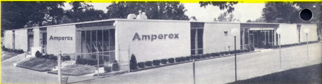
Amperex Semiconductor Manufacturing Plant Cranston, Rhode Island

In line with the growth, complexity and new applications of electronics, The AMPEREX ELECTRONIC CORP. research laboratories are continuously improving existing tubes and semiconductors, and developing new types.