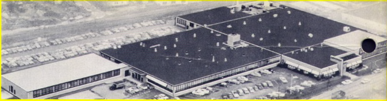
Amperex Electronic Corporation, Hicksville, Long Island, New York Sales Offices, Applications Laboratories and Tube Manufacturing Plant