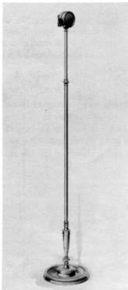
Figure 4—No. 618A-13 Moving Coil Type Microphone mounted in No. 19A-13 Mounting

The No. 285A Plug is of the portable type and is designed for use on the end of a cord.