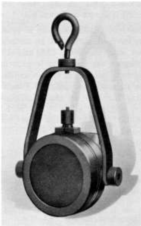
Figure 2—No. 618A-13 Moving Coil Type Microphone mounted in No. 17A-13 Mounting

The No. 406A Jack is of the portable type and is designed for use on the end of a cord.