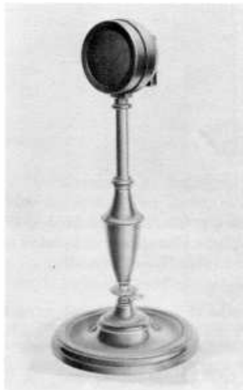
Figure 3—No. 618A-13 Moving Coil Type Microphone mounted in No. 18A-13 Mounting