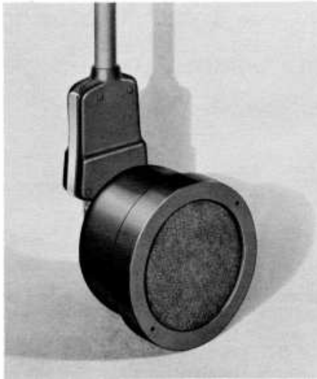
Figure 1—No. 618A-13 Moving Coil Type Microphone

The design and principles of operation of the No. 618A Microphone are such that it is not affected appreciably by any changes in temperature likely to be encountered in its use.