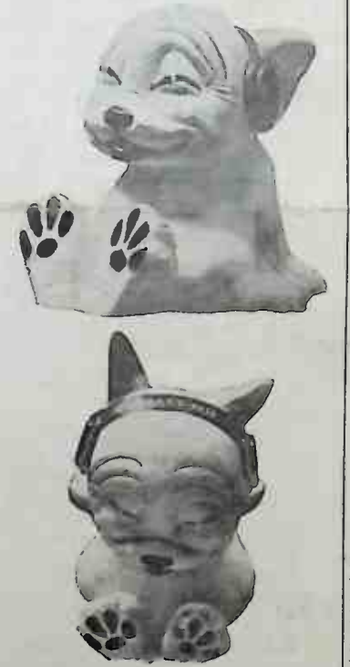
Nationally Famous Bonzo

"Bonzo," that famous PUP that has been in such demand among Crosley radio dealers because of its advertising value and which has been commented upon by thousands of people as one of the most attractive novelties ever seen, is now