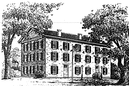
ACADEMY MUSEUM—East Bloomfield, N.Y., new home of the Antique Wireless Association Museum. The 136-year-old landmark is being completely restored after serving the educational needs of generations of young scholars from the surrounding villages and farms. It will house the headquarters of the East Bloomfield Historical Society as well as the AWA Museum.

Finally, at last, all columns showed up in time this week! Something must have gone right for once in the postal system.