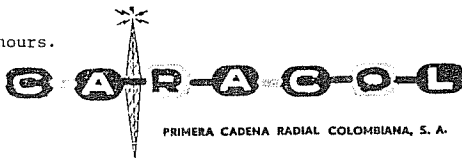
PRIMERA CADENA RADIAL COLOMBIANA, S. A.

630 WQBS San Juan now 5 kw, 24 hours. 760 WORA Mayaguez 0845-0430. 1110 WVJP Caguas now 2.5/.5 kw. 1210 WHOY Salinas now 5 kw. 1350 WEGA Vega Baja 0930-0230. 1430 WNEL Caguas now 24 hours. 1520 WRAI San Juan 0930-0400. 1530 WUPR Utuado 1000-0230. 1590 WXRF Guaymas now 24 hours. (Arctic 9.21)