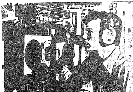
Udenlandsk radio er andet end Radio Luxembourg og Sveriges Radio. Læs her om den spændende hobby der hedder DXing!