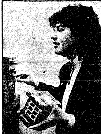
San Antonio Express 1-20-83 via Artie Bigley