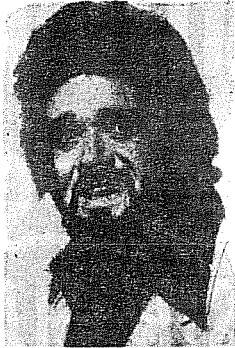
WOLFMAN JACK His pal to the rescue