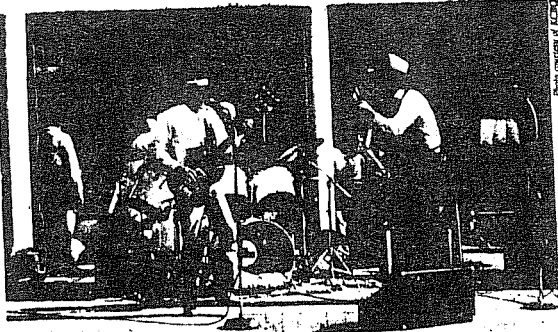
KCQB (1170 AM/105 FM) not only plays country music, it creates its own with the KCQB Country Flatbed Band, shown performing at the opening of the Lumber Yard Shopping Center in Encinitas.