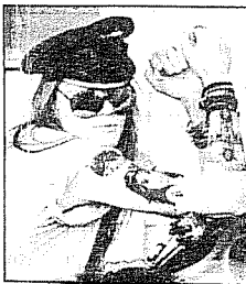
Guns 'n' Roses' W. Axl Rose ... catching a radio wave?