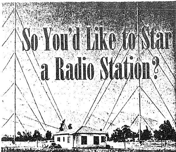
TRANSMITTER HOUSE in the Pasadena Valley. Great difficulty was experienced in getting this piece of property; Japanese squatters had planted the land in strawberries and refused to get off.

A combination of circumstances causes many AM and FM radio stations in the United States to change call letters quite often these days. However, I find a positive side to all of this. If you read through a current log of U.S. AM stations, you can still find a good number of them using the same call letters that they've had for 30 to 60 years. So, while another long-time AM broadcaster, KFAC, will be lost, we can at least say that the calls will stay on the FM side, but for some of us it just won't be the same.