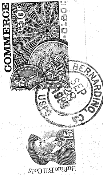
Buffalo Bill Cody

FROM: (714) 687-5910 International Radio Club of America 6059 Essex Street Riverside, CA 92504-1599 U.S.A.