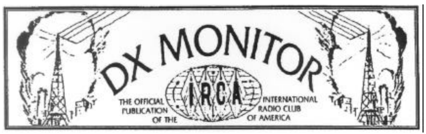
May 25, 2002 - Volume 39, Number 32b - Edition 1254b - ISSN 899-9733