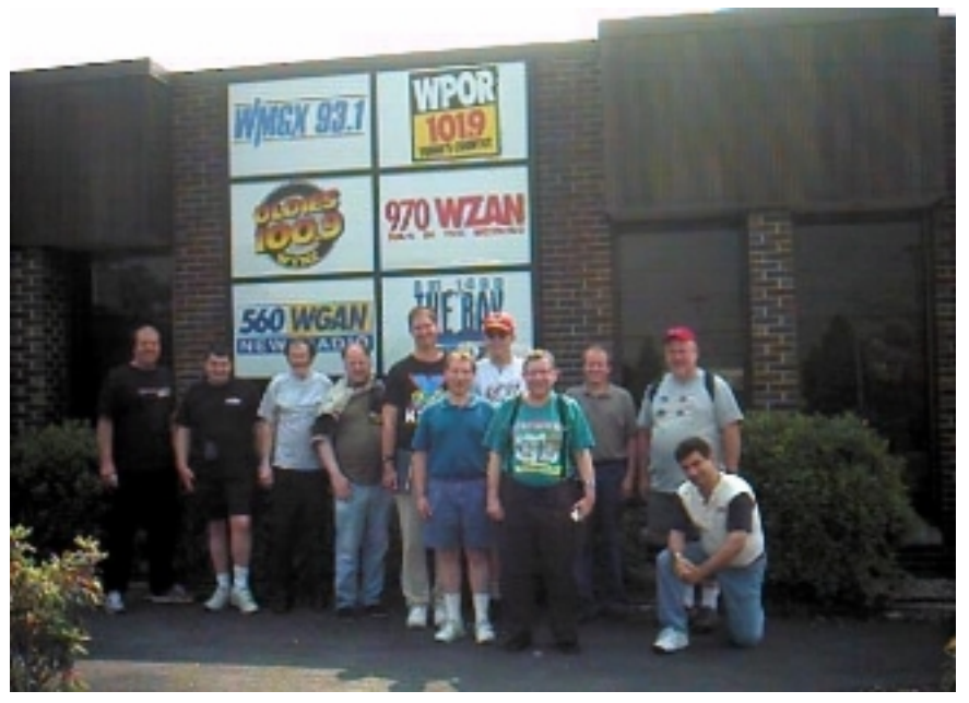
The official Group Photo