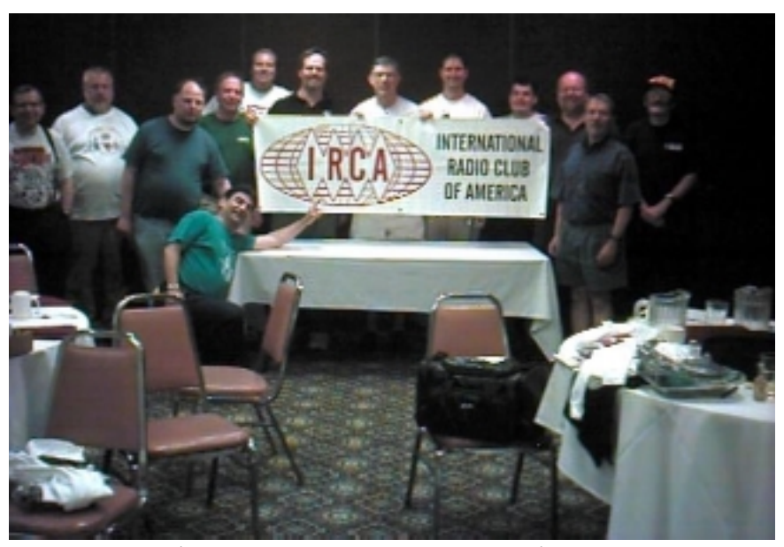
The banquet photo

For example, where 640 kHz had been dominated by Radio Guadeloupe, only Cuba was present. Transaltlantic DX was difficult. The A index was up, with auroral conditions indicated by the absence of WWV on 5000 kHz with the Venezuela time station alone on the frequency. There was some audio detected from 891 Algeria during local sunset, but