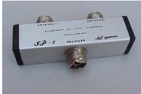
RF SYSTEMS SP-1

Model MC-102 was purchased directly from Stridsberg Engineering, 345 Albert Avenue, Shreveport, LA 71105, (318) 861-0660, FAX: (318) 861-7068 ( www.stridsberg.com ). The current retail price (2004) is $65 plus S&H. Frequency coverage, as listed by the manufacturer is 100 kHz to 500 MHz. The Stridsberg unit is exceptionally well finished and is the largest of the three commercial splitters, measuring about 5"W x3"D x1.5"H, counting the ports. The company welcomes telephone orders, for even a single unit, and does ship overseas.