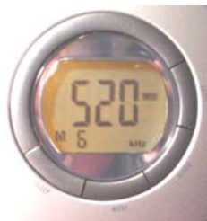
10 kHz spacing on MW