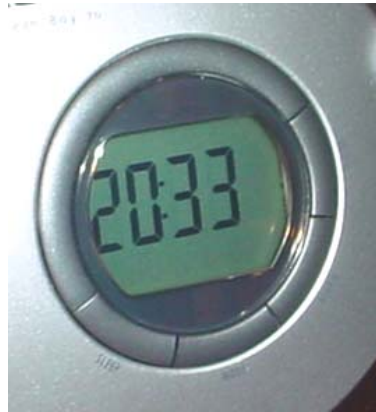
European style 24 Hour Time display

Secondly, although it is a multiband receiver, it is designed for the average listener. The styling dictates the user friendliness, which means that it's meant for people who have their favorite stations programmed into the 20 presets. The up/down slewing is fine on LW, MW and FM, but is not practical for regular SW "channel surfing". The fast scanning mode took 15 seconds to go from 522 to 1620 kHz by 9 kHz jumps, 23 seconds to go from 87.5 to 108.0 MHz in .1 MHz jumps, and 15 seconds to go from 144 to 281 kHz in 1 kHz jumps. It just takes too long to run through all of the SW band! I timed approximately 23 seconds to go 1 MHz, or 3 minutes 38 seconds to run from 5.950 to 15.600 MHz. Presets could be used as jumping on places, however.