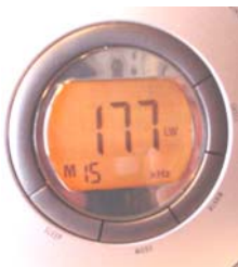
1 kHz spacing on LW

Finally, there is a slider on the bottom of the radio, which disables or enables all of the buttons.