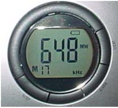
Low Battery indicator, top right

Disney. The Ocean Boy 70 nulls more deeply, although some of that may be due to the higher noise floor.