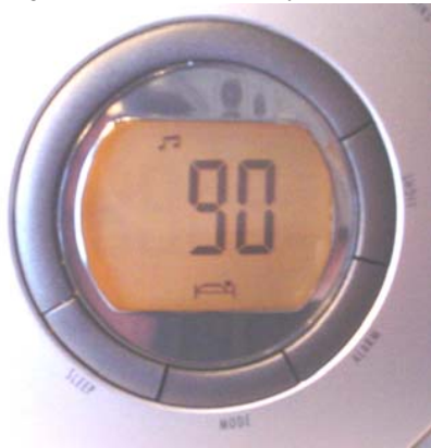
90 minute sleep setting (illuminated)

Although Grundig as a company has seen better days (it's now owned by Sampo of Taiwan and the automotive radio division was sold to GM's Delphi), it still tries to live up to its past image. First thing that strikes you is the styling. It's quite unlike most Asian-engineered boxes, and according to Grundig's web site, the Ocean Boy 70 won a design award.