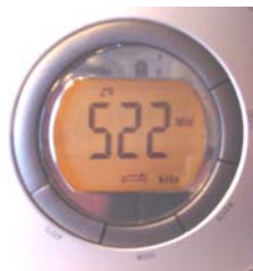
9 kHz spacing on MW

Volume and tone are adjusted by the two gray rubberized thumbwheels on the left side of the radio. A headphone jack is positioned between the thumbwheels, but output is mono. Two switches on the right end of the radio are used for "DX" and "local" sensitivity on FM and SW only, and for alarm sound or radio reception when the wakeup function is used. An oval "snooze" button interrupts the alarm for 5 minutes.