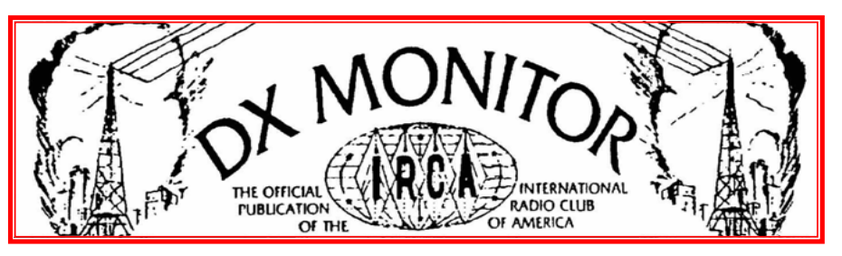
March 3, 2005 - Volume 42, Number 23 - Edition 1345 - ISSN 899-9733