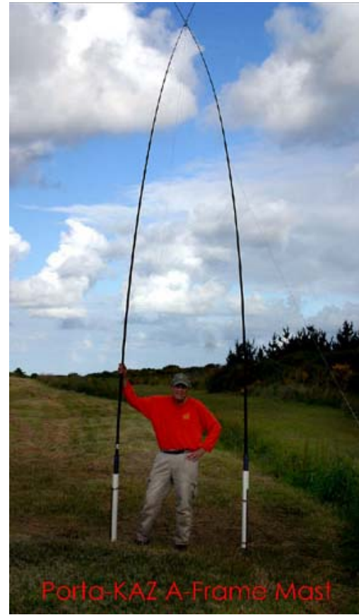
Porta-KAZ A-Frame Mast