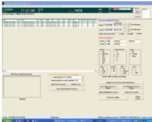
Figure 3 -- R8B Recording component form

Using the session entry form in my application, I enter and save these parameters. I click a button on the form to activate a timer that constantly checks to see if it is time to begin a recording session. I choose to turn the computer display off and walk away from the computer.