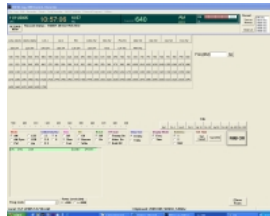
Figure 1 -- R8B Control component form

Though the Drake may be controlled from the PC in this manner, the controls on the actual front of the receiver still respond to manual commands. It is interesting to turn the tuning knob on the R8B and watch the frequency readout in the computer application change accordingly.