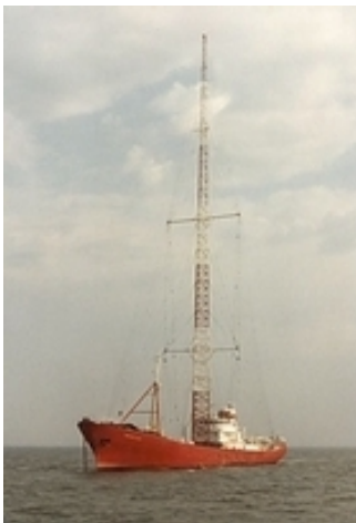
Ross Revenge Radio Caroline 1983-1987