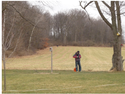
Laying the antenna wires