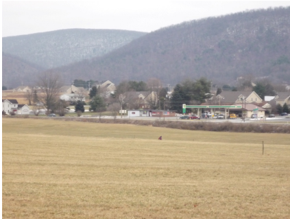
Looking out at 90 degrees