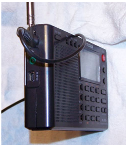
Port Updated.pdf. Reference to that article is strongly recommended.

This article is a continuation of the Ultralight DXing article "Directly Connecting External Antennas to Small Portable Radios" that was widely published in 2008. That article detailed my "discovery" of the "swamping effect" that greatly simplified adding a highly effective antenna port to Ultralight and similar portables, allowing them to be directly connected to Beverages, phased arrays or other major outdoor antennas. Possibly more importantly, the swamping effect virtually eliminated the internal ferrite bar as a receiving antenna (while connected to outdoor antennas,) thus eliminating all internal shack and house noise from the MW band. That same swamping effect also solved impedance matching the outdoor antenna to the ferrite bar, allowing very effective use of the outdoor antennas for DXing. The original article is found in the "Antennas and Equipment" section of the Ultralight Library at Ultralightdx.com , the Yahoo group, and at dxer.ca (under "ULR Antennas"). At both sites, the article is under the name "Ultralight-Adding An Antenna