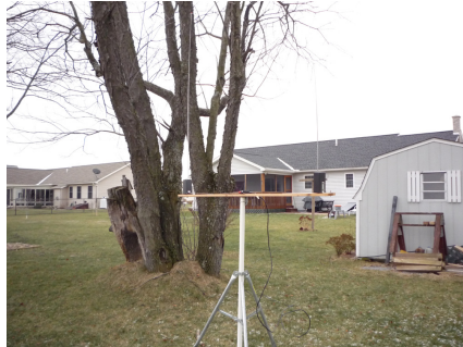
6-foot broadband loop