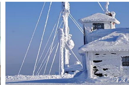
Digita's antennas on top of Mount Kaunispää