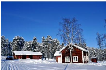
DXing headquarters of the North

Let's focus again on the essential.... This was not a culinary adventure, but an expedition to discover something new on the AM dial. Most of Lemmenjoki's dozen or so Beverage and longwire antennas were used at some point, although clearly the best antennas were a wire pointing to the Northwest at 319 degrees, and another pointing to the East at 55 degrees, used for Asian stations.