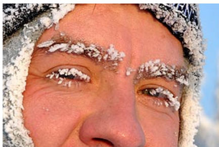
Freezing, but at least it is sunny