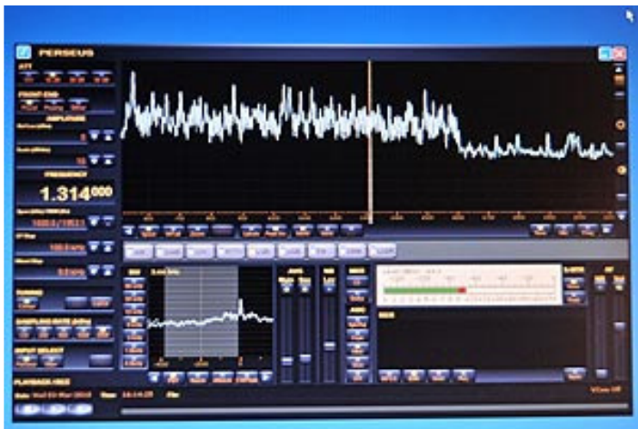
The entire AM band on Perseus

dominated frequencies. US stations prevailed until around 1100 UTC, which is almost six hours after sunrise in Lemmenjoki. That's also when the first Asian stations began their typical five-hour onslaught, first it was the Japanese, and later on stations from further south along the Pacific Rim – though unfortunately not all the way to "down under".