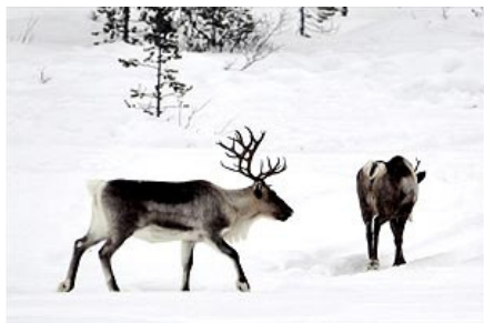
Reindeer on ice close to our cabin

herds to higher grounds through this area, and so reindeer were passing our cottage almost daily. This time of the year the reindeer are beginning to leave their winter feeding areas, heading up to the fells, where snow is exposed to the sun and melts faster – making it easier to find lichen on the Arctic tundra.