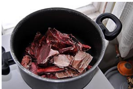
Rudolph the red-boned reindeer

Also, some reindeer had been domesticated by the neighboring households, and although they are free to roam around, they always return home, where food is more plentiful than in nature during this exceptionally harsh winter.