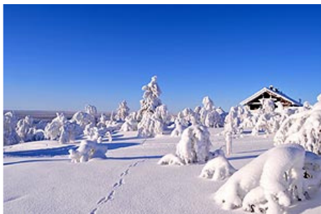
The southern slope of Mount Kaunispää in Saariselkä, close to our rental cottage

because of temperatures hovering around -20 to -30 degrees, but fortunately on the following week the AM band turned out to be hot. This combo vacation was a success, as we got a bunch of new stations, and our wives have not divorced us, at least not yet.