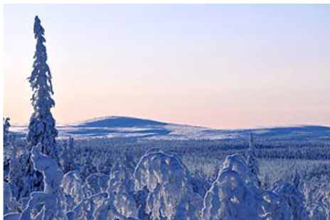
Kiilopää Mountain in Saariselkä in the distance

I shopped for groceries and headed back above the Arctic Circle, which runs just north of Rovaniemi. The roads were unusually quiet, probably because most people were home watching the Olympic ice-hockey semi-finals. Finland suffered a colossal loss to the US in Vancouver, so I certainly didn't miss anything while driving in crisp -30 degree weather to Lemmenjoki.