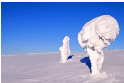
Ice-covered trees near the top of Mount Kaunispää in Saariselkä

Propagation conditions during our week turned out to be good, but very different from what we had expected. We were hoping to hear some stations from Australia and New Zealand, maybe also from Thailand and the rest of South East Asia. On the western front, this time of the year should have been good for instance for targeting Peru.