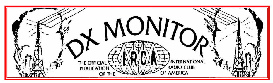
September 11, 2010 – Volume 48, Number 2 – Edition 1509 – ISSN 899-9733 IN MEMORY OF THOSE WHO LOST THEIR LIVES ON THIS DAY IN 2001