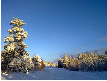
The road between Kaamanen and Sevettijärvi, close to Aihkiniemi