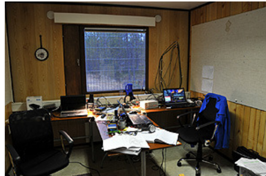
The DX central of Aihkiniemi

As receivers we relied solely on the Perseus, which should guarantee enough recordings to entertain us for