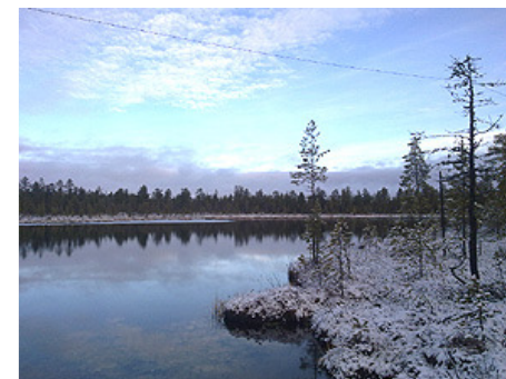
One of the beverage antennas at Aihkiniemi

This DXpedition entailed more uncertainty than normally, as Aihkiniemi was still somewhat a work in progress. I and Jim are among a group of eight DXers who purchased a lakeside lot in northernmost Lapland earlier this year to set up the first ever purpose-built AM DXing base in Finland, if not the first such endeavour in Europe or the World.