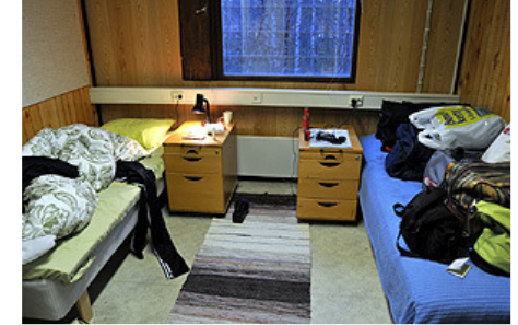
A shared bedroom – better make sure that your partner doesn't snore!