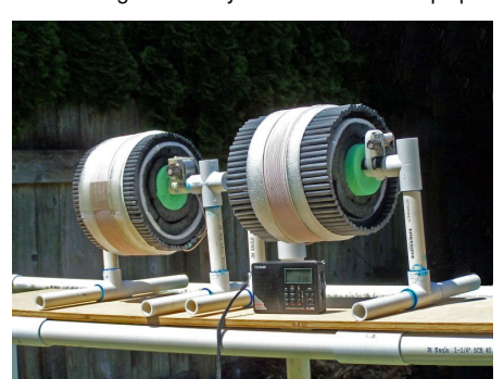
Figure 1 Twin FSLs, DXpedition model on right, before MW frequency conversion

http://www.mediafire.com/?9tjd0pqpa4ld2f0; for a detailed overview of PVC loops, see 12 September 2009 DX Monitor). But recently there has been a lot of experimentation with Ferrite Sleeve Loop antennas (see the IRCA Technical Column in 12 March 2011 DX Monitor for a description of the FSL), indicating that these compact ferrite-based antennas provide a real DXing breakthrough for hobbyists with limited setup space. As such, it was time to see if one of the new