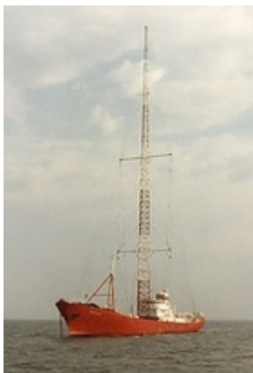
Ross Revenge Radio Caroline 1983-1987

The CD is fully interactive and uses links to ensure you can quickly find the info you need. The main station listing uses a spreadsheet that you can sort and filter data as you wish.