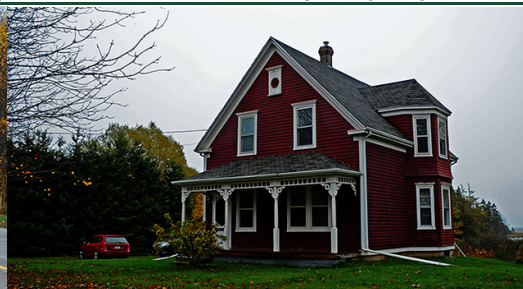
DXpedition site: Route 17 and the 'Listening Waters' Victorian Farmhouse in Murray Harbour North