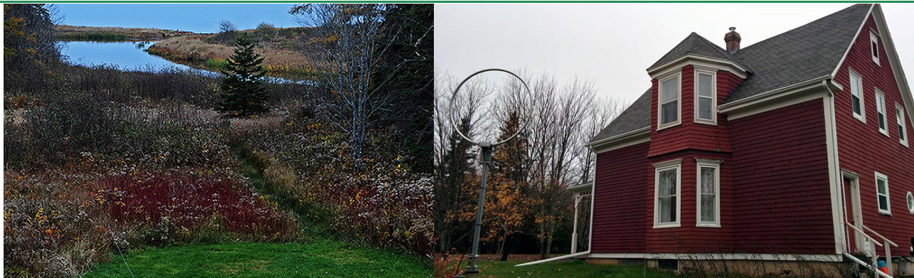
The 120° Beverage disappears into the brush and woods, and the Pixel AM-2 loop (Taylor photo).