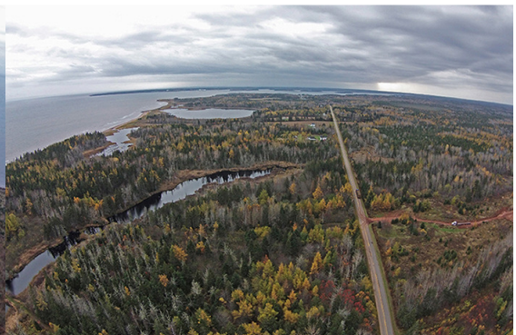
North and South