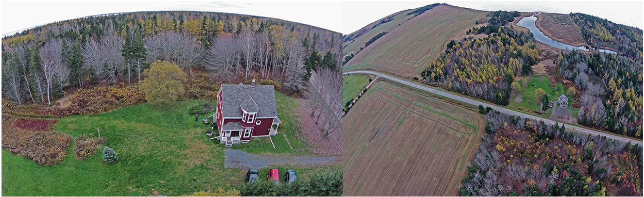
'Listening Waters' Victorian Farmhouse