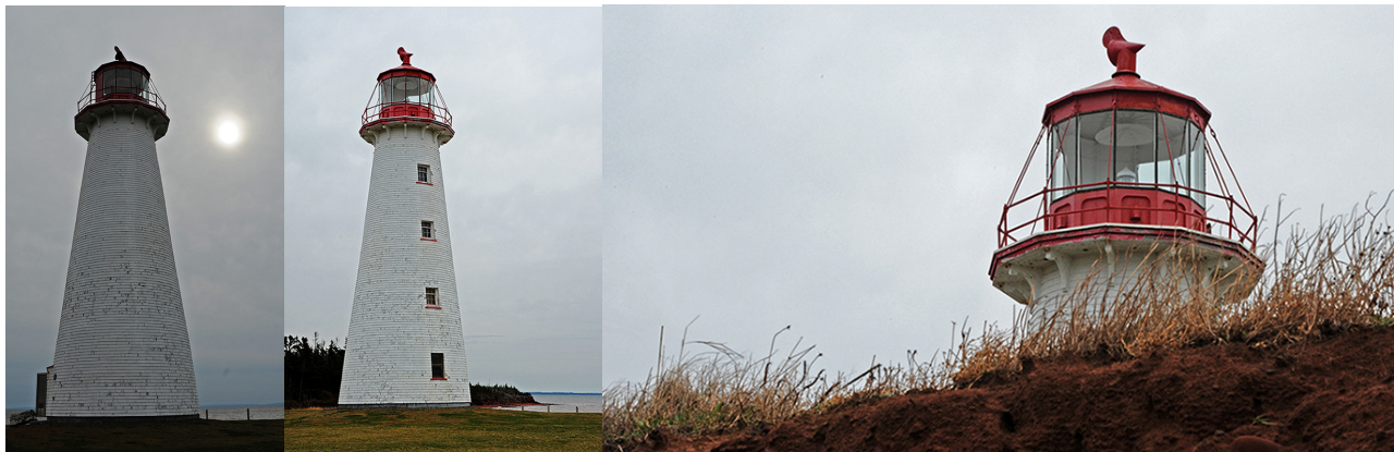
Point Prim Lighthouse