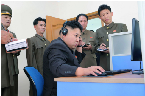
That South Korean jammer on 1053 is being heard in PEI?