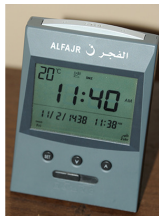
Call to DX alarm clock