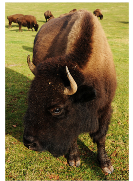
550 NEW YORK WGR Buffalo NOV 12 1000 – Hourtop ID and ESPN SportsCenter. [Wolfish] (Buffaloland Park photos)