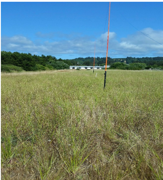
Figure 1: DKAZ 600 feet from motel

76 Australia logs, 63 New Zealand logs and 34 Japan logs. A rather good result for Japan, especially.