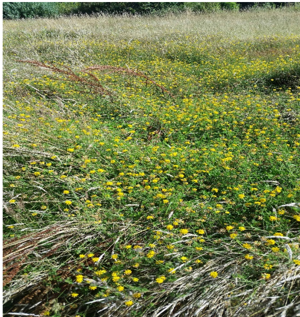
Figure 2: Carpet of flowers making the DKAZ look pretty

Yes, the grand tradition continues. Bruce Portzer and I did a 2 day DXpedition to the Breakwater Inn (nee Grayland Motel) to check out the renovated motel.