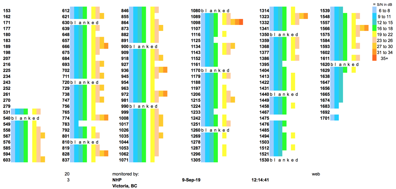
9 kHz channel signal strength from Grayland, WA, USA; 1000' Beverage antenna aimed west, feeding RFSpace SDR-14