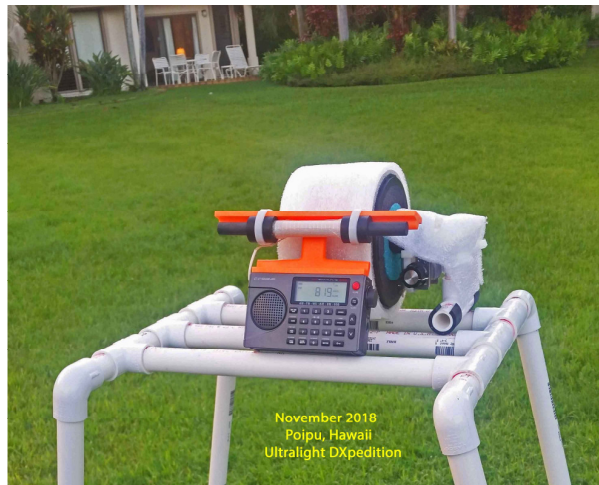
November 2018 Poipu, Hawaii Ultralight DXpedition

By Gary DeBock, Puyallup WA, USA – September 2019